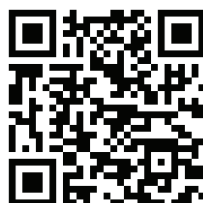
QR code web site results