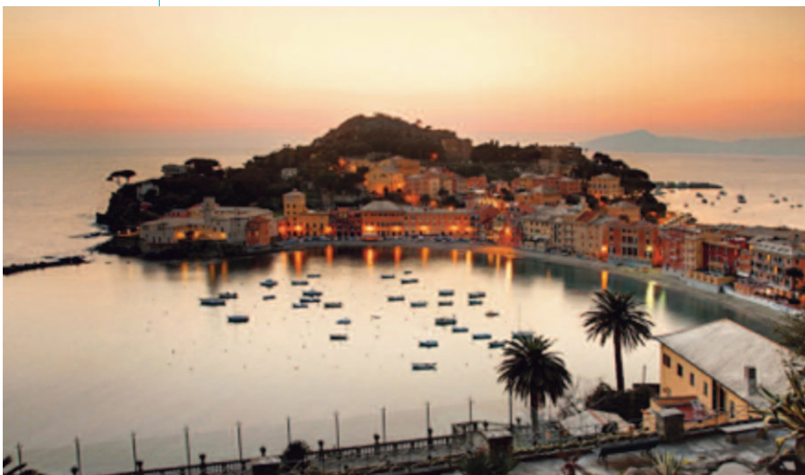
< Sestri Levante

Rowers will spend the night in Monterosso area.