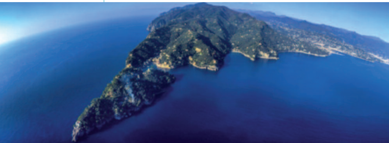
< Promontorio Portofino