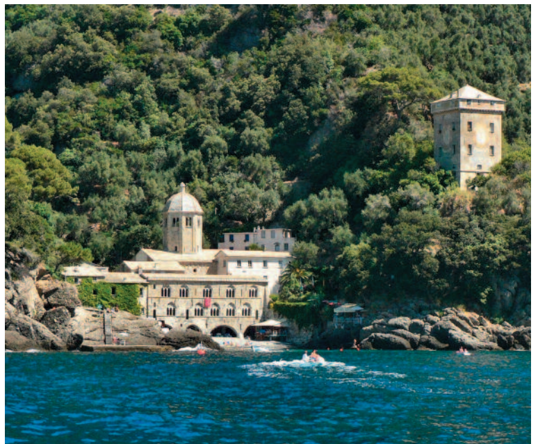
San Fruttuoso >