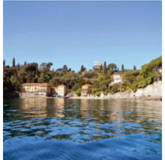
San Michele di Pagana >